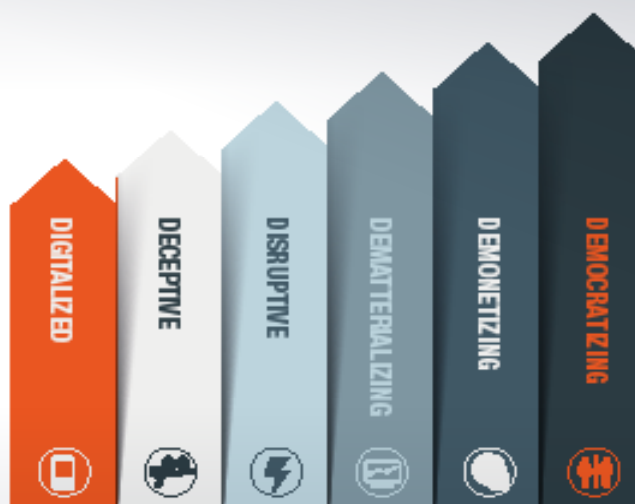
Figure 2: Steven Kotler's 6 D's of exponential growth

So, what does this tell us about the future of wearable sensor technologies in general and the intelligent continence product specifically? As the advantages of the wearable sensor technology become widely accepted, the technology and the intelligent continence products will become democratized. So, in the future we will all have access to intelligent wearable sensors in a number of products and services, including continence products. Caregivers will not only know whether the resident has a wet continence product, they will also know whether she has an infection, she has been exposed to pollution, she is inside or outside, her pulse is steady, and so on. The next step for us is to decide the detail of the information we really want and how we can use it in the best way to provide the very best quality of care.